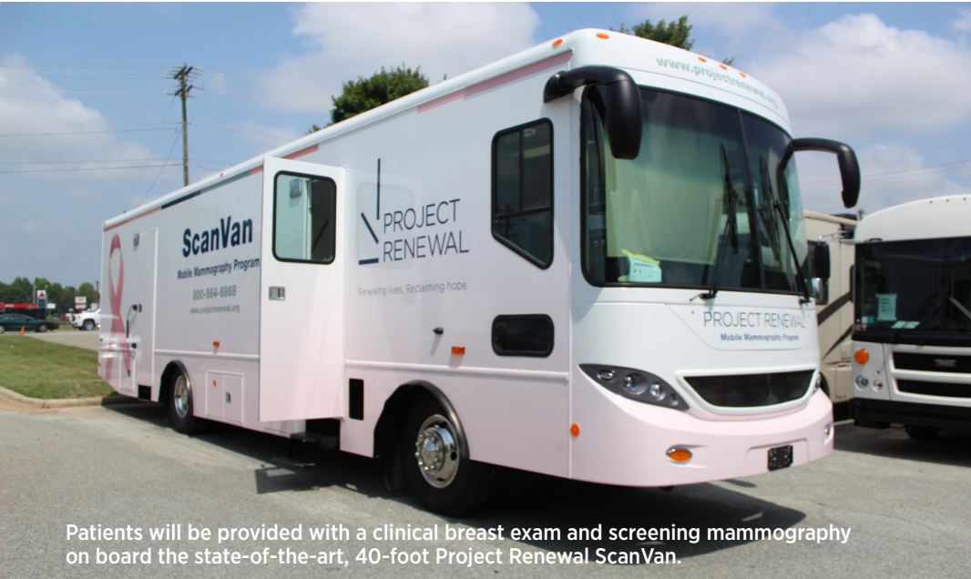
Patients will be provided with a clinical breast exam and screening mammography on board the state-of-the-art, 40-foot Project Renewal ScanVan.