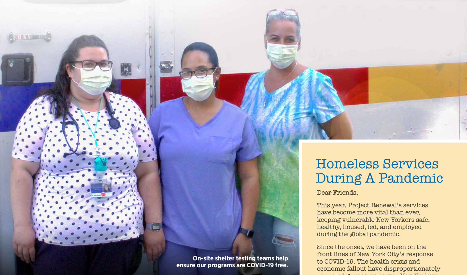
On-site shelter testing teams help ensure our programs are COVID-19 free.