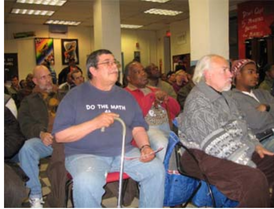
Clients participating in recreational programming activities

Programs like the one featured above are a part of Project Renewal's recreational services. In our continuum of care, beyond providing food, shelter, healthcare and employment services, our shelters are staffed with Recreation Directors, for creating social events where men and women can participate in activities that do not involve drugs or alcohol.